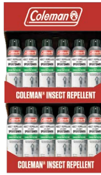
40% DEET Sportsman Insect Repellent 24pc Sidekick Display