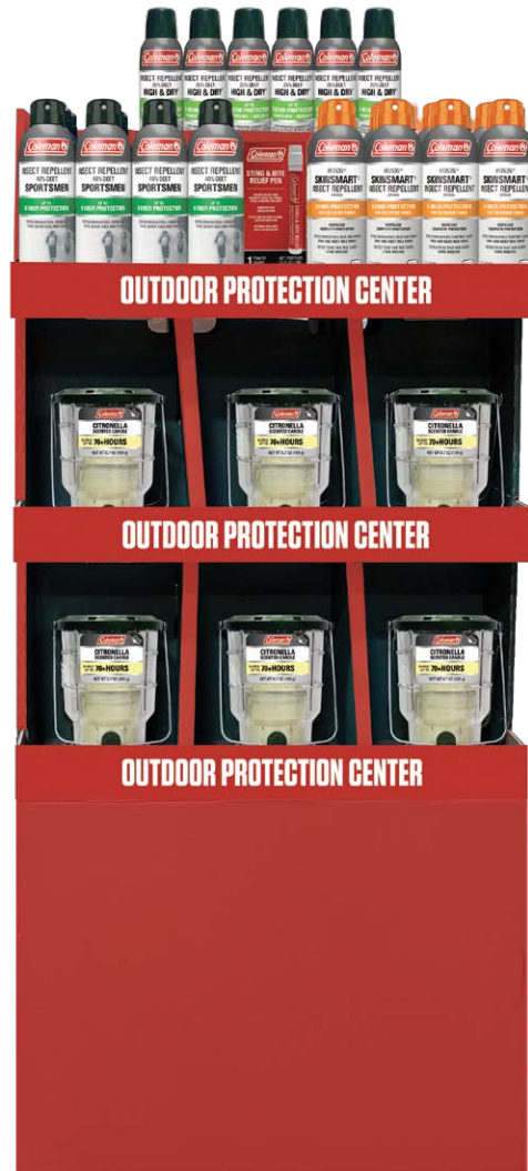
Outdoor Protection Center 78pc Floor Display