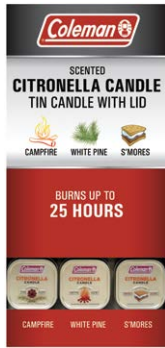
Scented Citronella Tin Candle 18 pc Sidekick Display