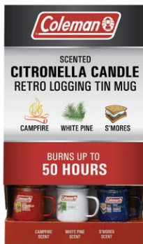
Scented Citronella Mug Candle 18pc Sidekick Display