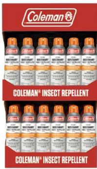
SkinSmart® Insect Repellent 24 pc Sidekick Display