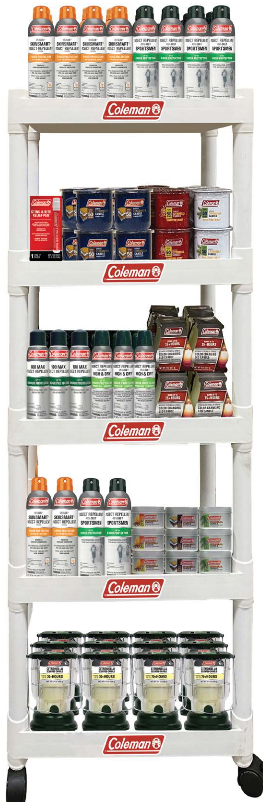
Coleman 5-Shelf 214 pc Floor Display