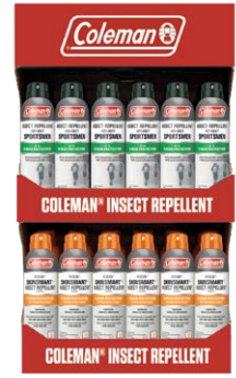
40% DEET | SkinSmart® Repellent 24 pc Sidekick Display