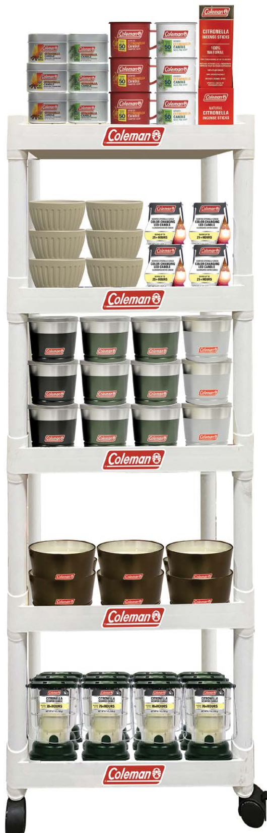
Coleman 5-Shelf NEW! 154 pc Floor Display