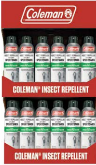
40% DEET Sportsman Insect Repellent 24 pc Sidekick Display