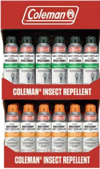
40% DEET | SkinSmart® Repellent 24 pc Sidekick Display