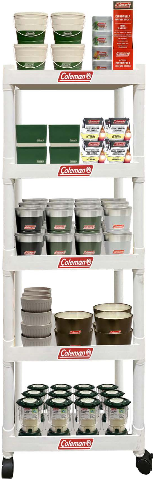
Coleman® 5-Shelf NEW! 142 pc Floor Display