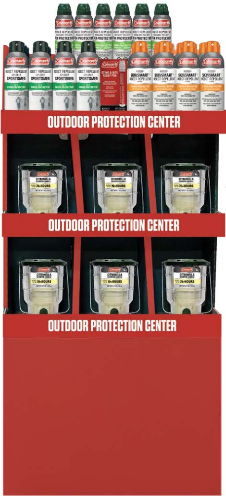
Outdoor Protection Center 78 pc Floor Display