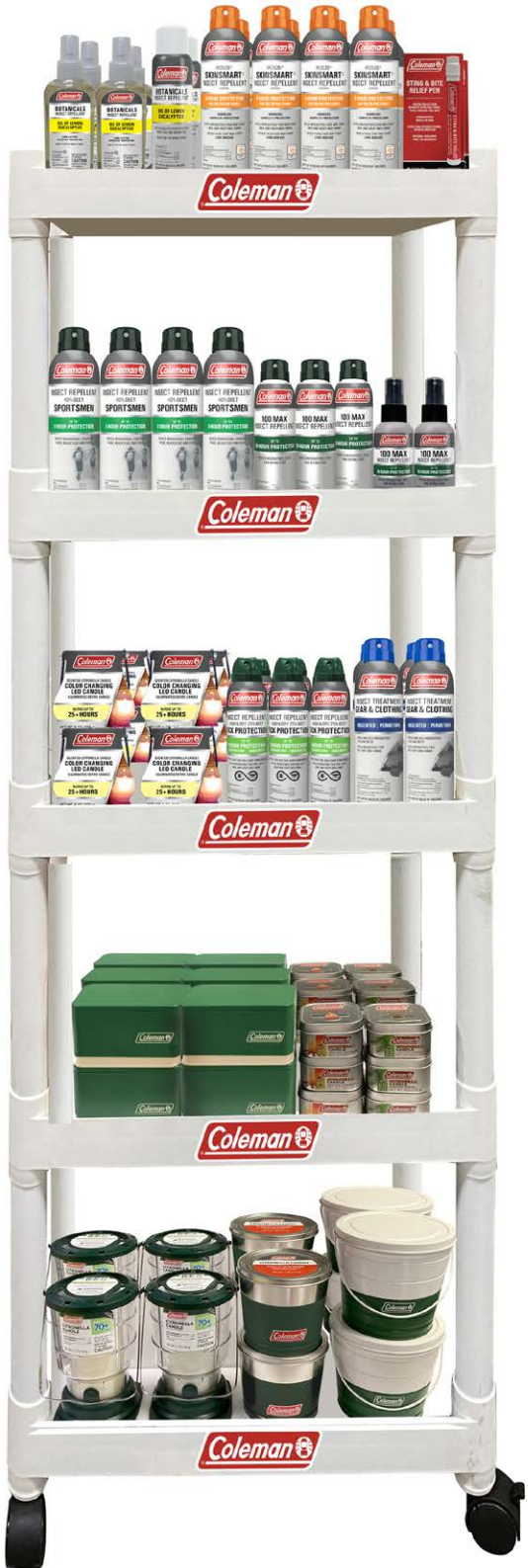
Coleman® 5-Shelf NEW! 214 pc Floor Display